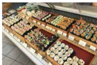
all sushi gluten and dairy free