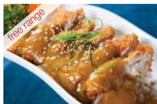
chicken katsu curry don