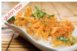
tempura vege don